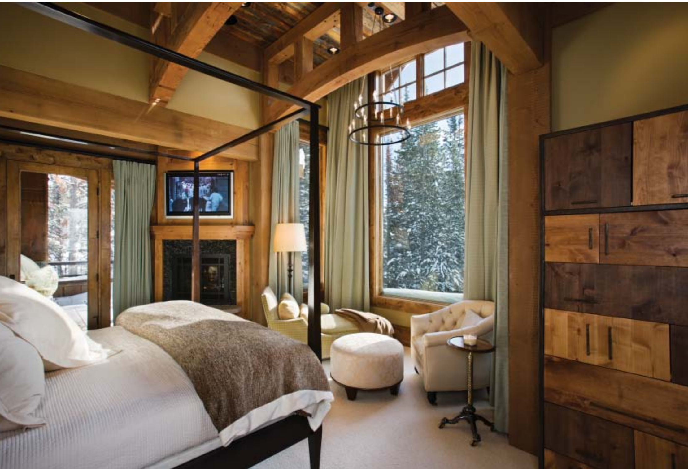
OPPOSITE: “We wanted the master bedroom to be a peaceful haven,” says interior designer Kath Costanti of the room’s muted palette and luxurious textures. The bed is topped with a hand-woven duvet with a lush cashmere backing; a custom dresser adds more visual texture to the room. BELOW: “There are even views from the tub,” says architect Jerry Locati of the master bathroom’s modern version of an antique claw-foot tub.